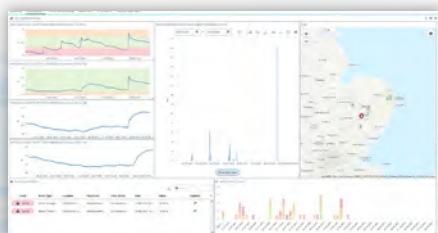
Agrimeteorological dashboard: Observed soil moisture, precipitation and alarm overview