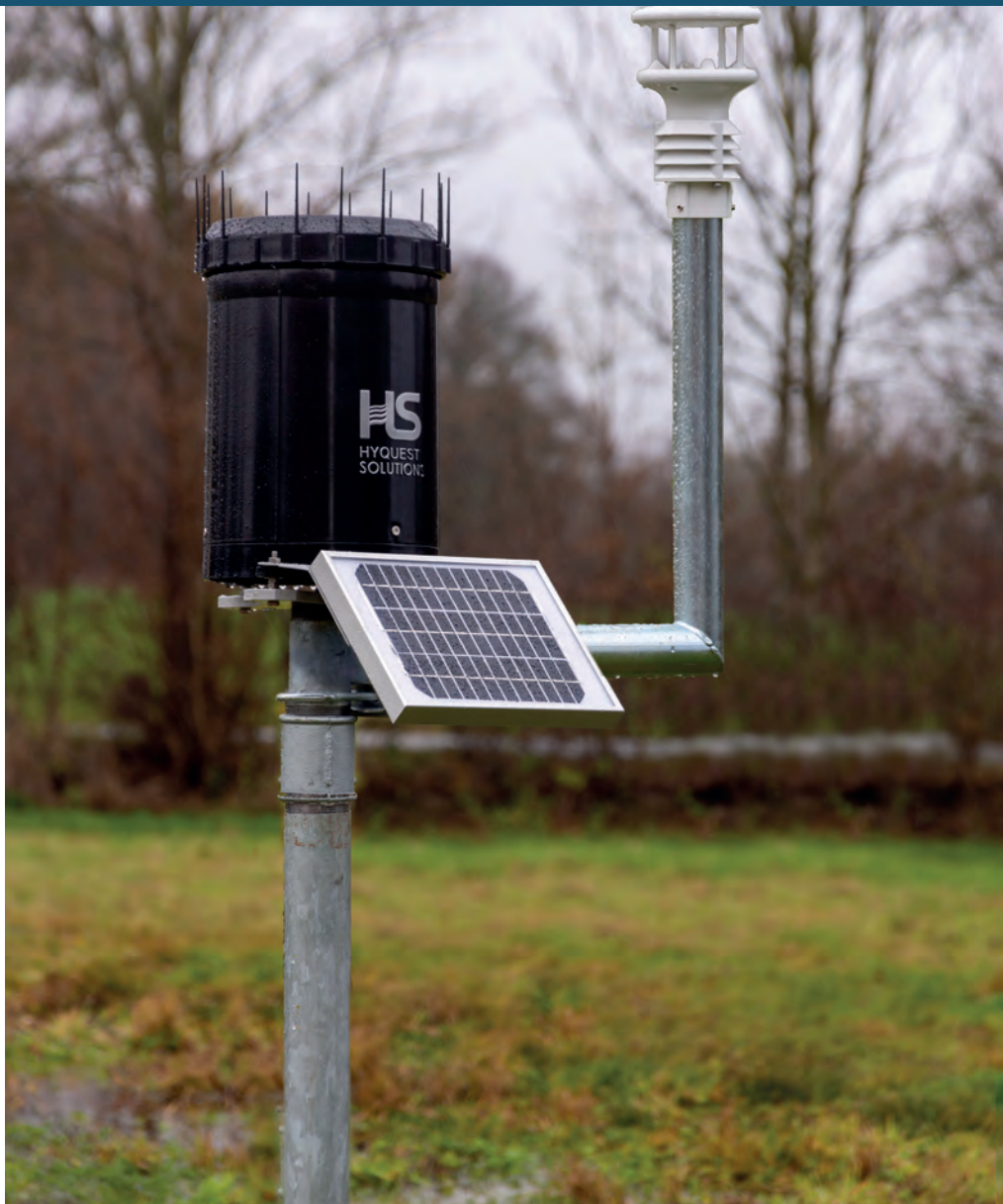
FieldRay Plant Protection - Agrimeteorological Monitoring Station: Rain Gauge with solar panel (left), Weather Station that measures wind speed, solar radiation, temperature, relative humidity, wind direction (right)