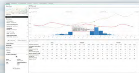
Forecast view for several parameters (e.g. temperature, precipitation) for the next 2.5 days in 3-hourly timesteps